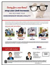
2019 Loan Limit Purchase Co-Brand