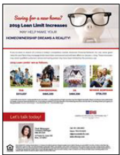
2019 Loan Limit Purchase

STEP 4: Click on a Flyer to choose it >>>