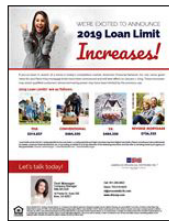
2019 Loan Limits Overview

Step 5: Click the Download Flyer Button and SAVE the flyer that generates so that you can print it or attach it to an email.